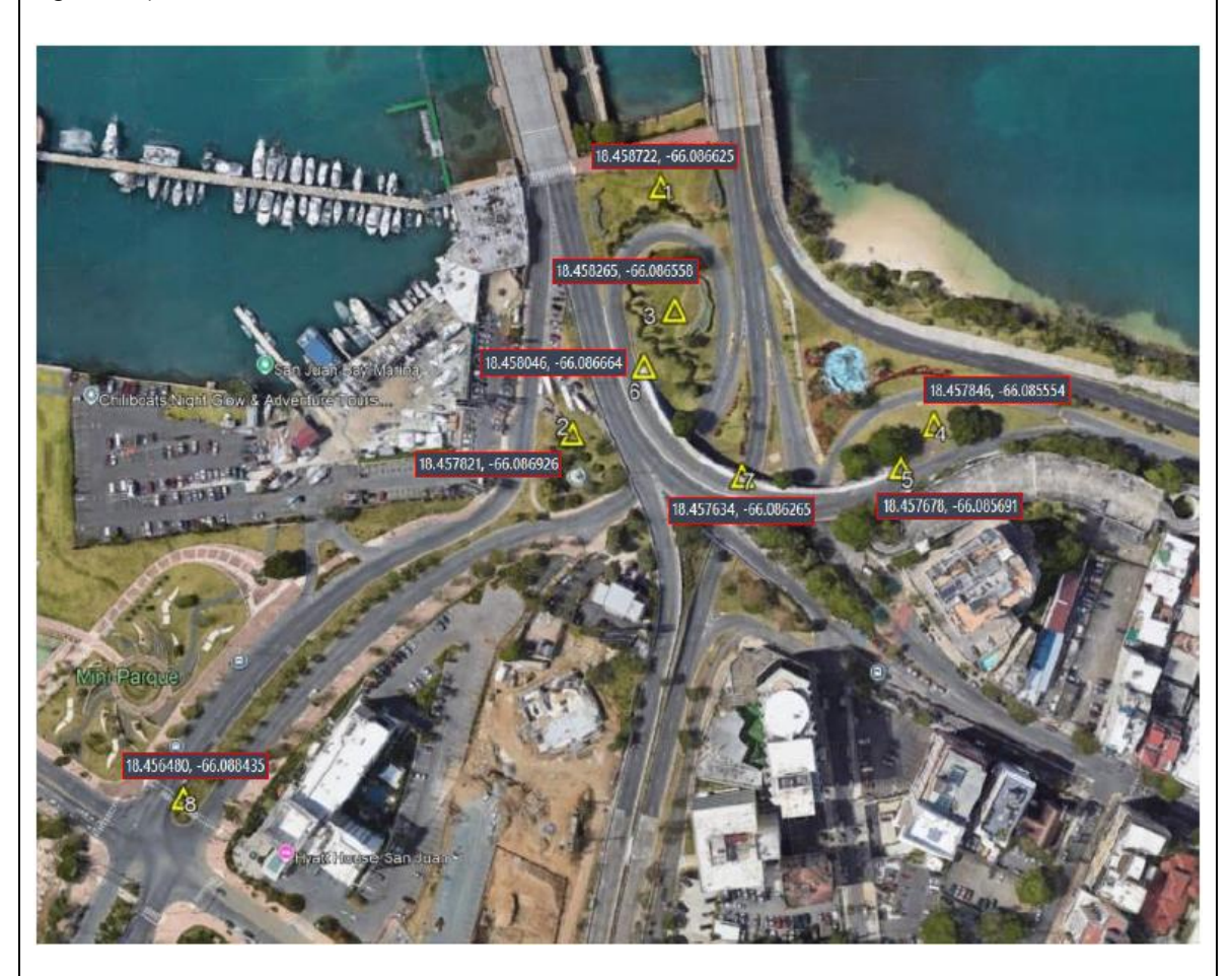
FIGURE 3- PEDESTRIAN ACCESS COORDINATES