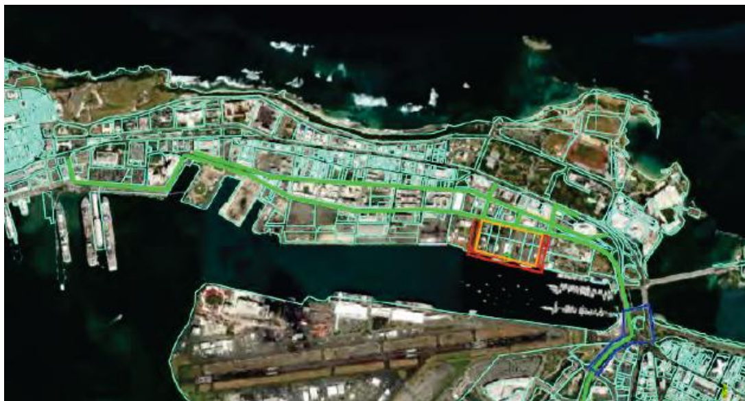
Figure 1- Aerial Image with proposed projects: Navy Frontier Pier Site (Red), Infrastructure Street Improvements (Green), and Pedestrian Access (Blue).

As part of the Navy Pier/Bahía Urbana Infrastructure Project, the PRCCDA proposes the construction of three (3) components/projects.