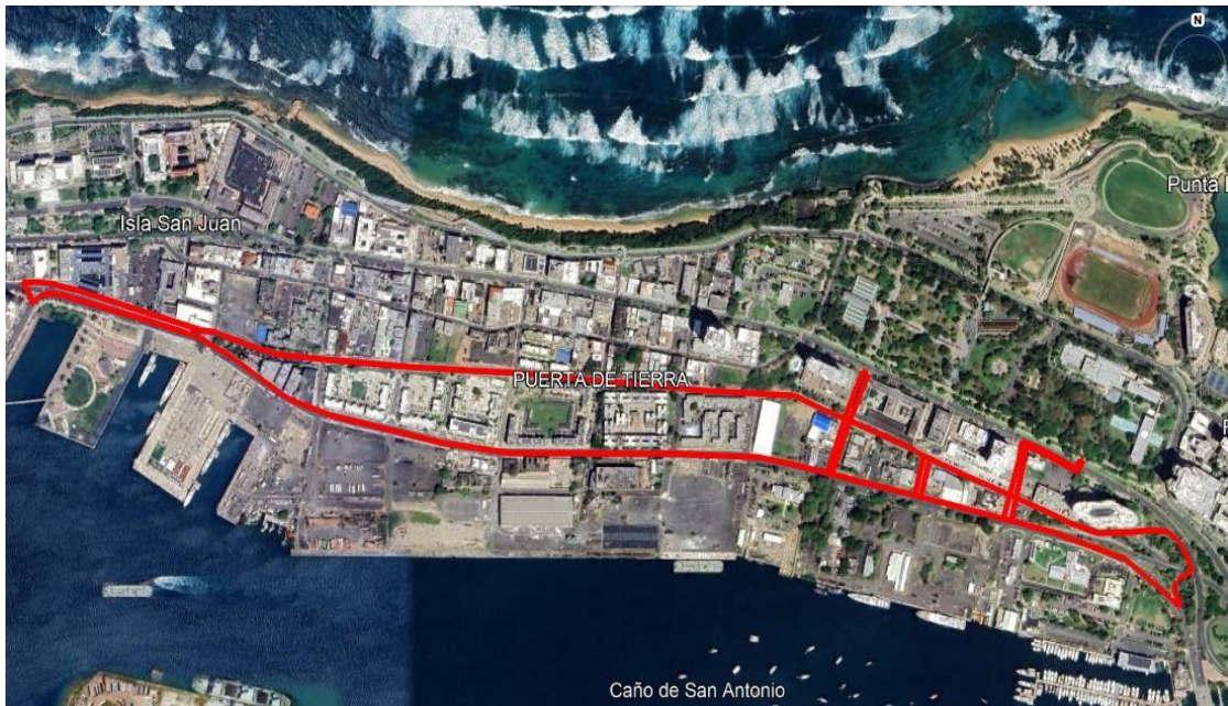
Figure 3- Aerial Image of the FJ Project