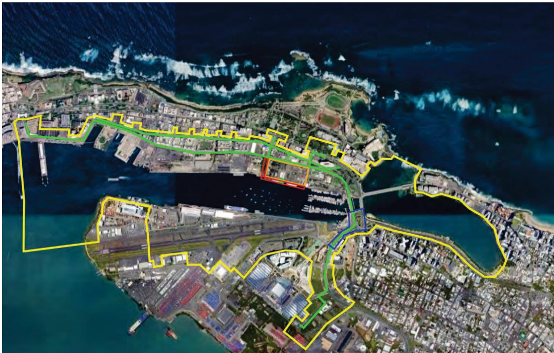
Figure 5 - Project APEs and visual APE shown on a current aerial image.