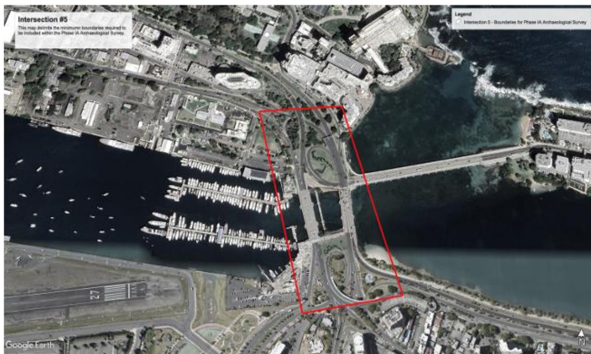
Figure 6 - Preliminary delimitation of Phase IA Archaeological Study - Intersection #5.

Intersection #5, is a historically sensitive transportation node associated with documented defensive lines and historic infrastructure. Ground-disturbing