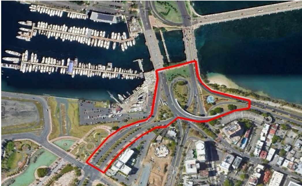
Figure 4 – Aerial Vision of the Pedestrian Access Footprint